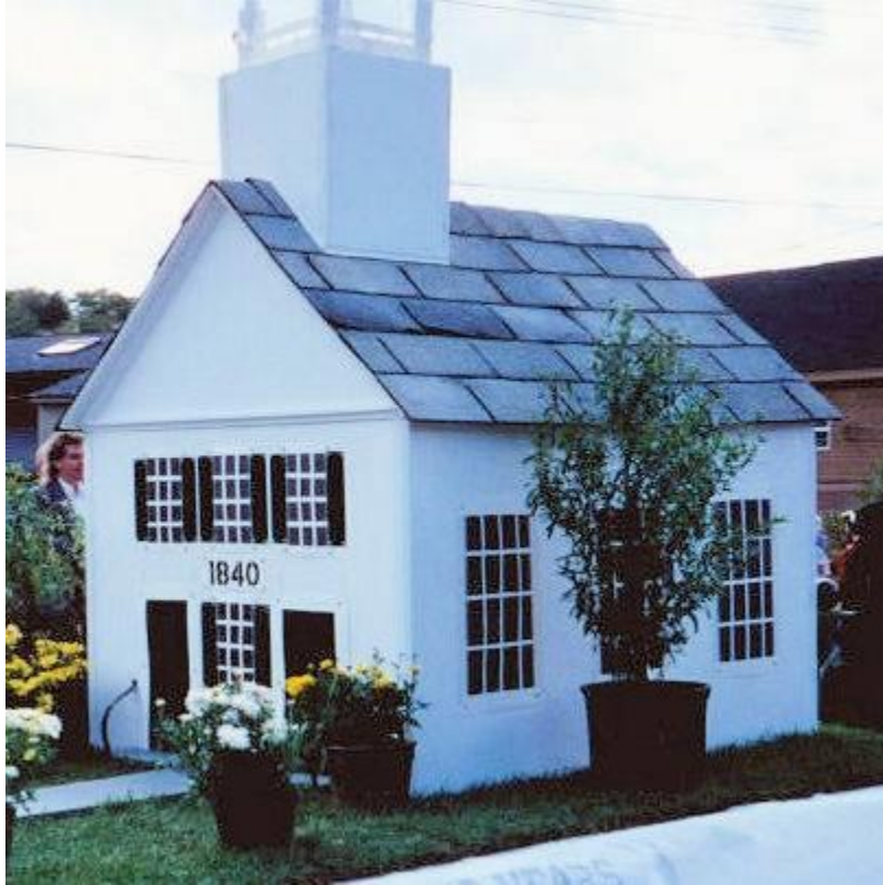
The PUMC float in the Peterborough 250th parade, 1989. Throwback Thursday! #tbt

Have you given us a Like on Facebook ? Good stuff on there. We're also on Instagram and YouTube .