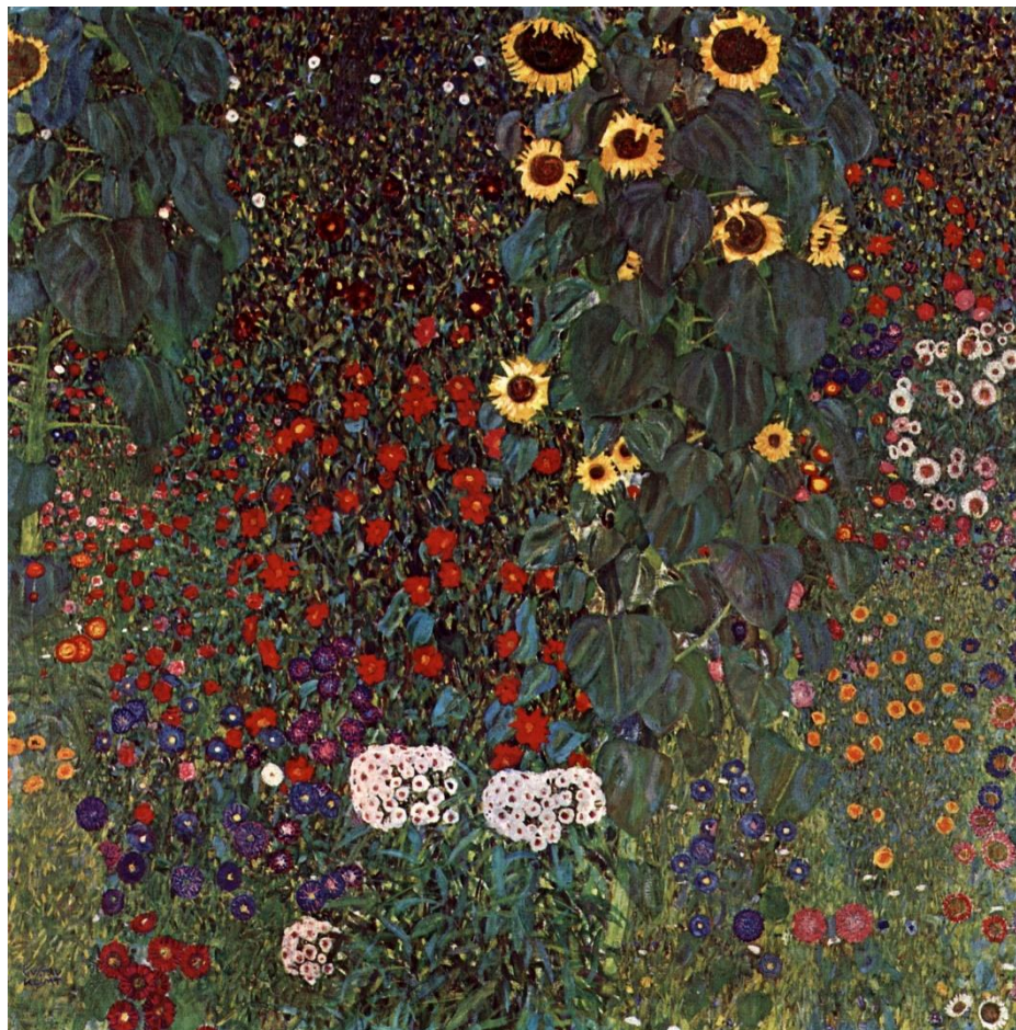
Image credit: Garden with Sunflowers, 1905-1906, Gustav Klimt, Österreichische Galerie Belvedere, Vienna, Austria